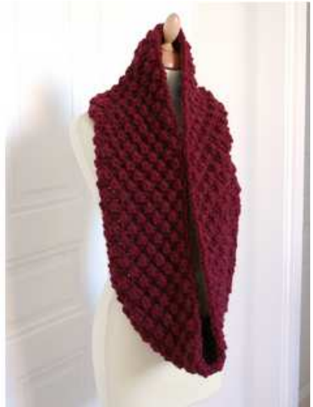
Original blogpost: <a href="http://bmade.canalblog.com/archives/2015/11/05/32844558.html">http://bmade.canalblog.com/archives/2015/11/05/32844558.html</a>

This free pattern is for personal use only. Do not reproduce this pattern to sell and/or sell any garment that you make using this pattern.