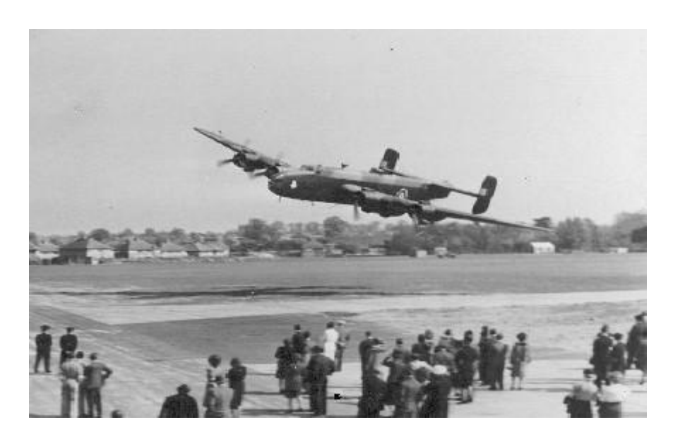
Remember, WE LEAVE NO HALIFAX BEHIND

It is with the utmost urgency Halifax 57 Rescue asks for your renewed and continuing support in these most trying times. The Halifax Project must go ahead without interruption or delay!